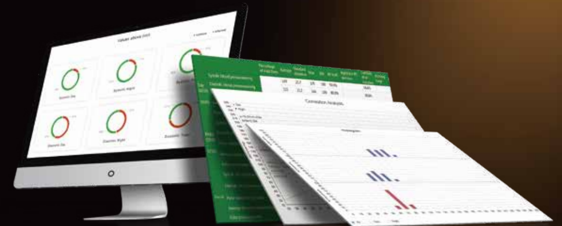
Pie Chart Analysis

With the aid of the SA-10's powerful analysis software, the clinicians can have a better insight into the variation of patient's blood pressure within 24 hours, easily identifying the periods when the blood pressure values are above limits. The informative statistical table provides a clear presentation of the measurement summary throughout the day.